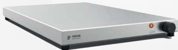
64-RF, Stainless Steel