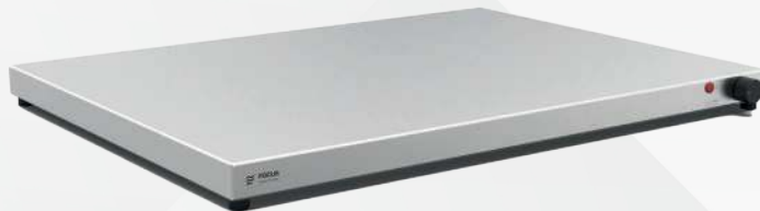
68-RF, Stainless Steel