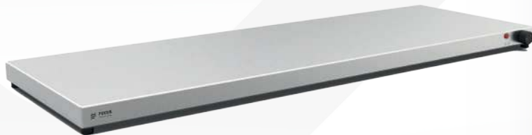
412-RF, Stainless Steel